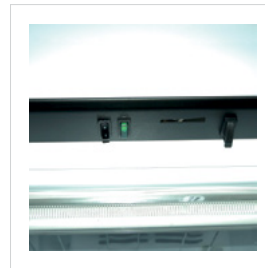
Internal and external light points.