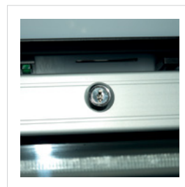
Security features (lock and key)