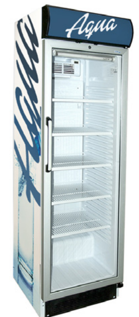
Custom image showcase.(optional)