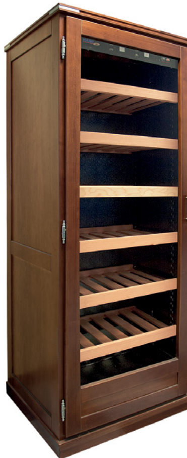
Model: L1 Capacity: 120/150 bottles Dimensions 625x1765x600mm (widthxheightxbottom)