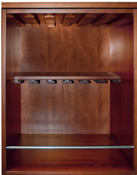
Model: M1 Capacity: glasses and bottles Dimensions 625x970x600mm (widthxheightxbottom)