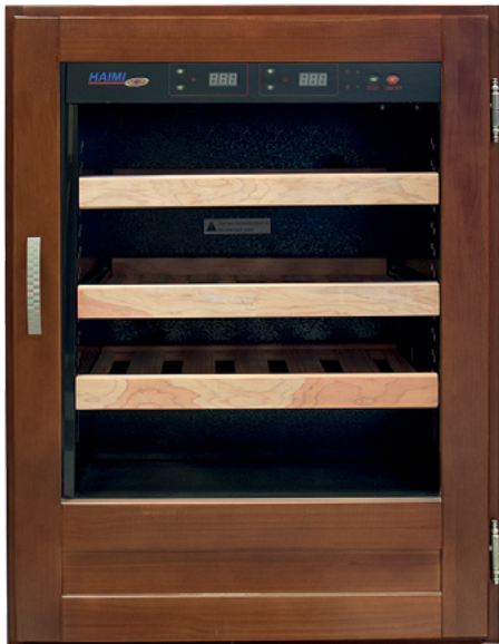
Model: M1 Capacity: 34/50 bottles Dimensions 625x970x600mm (widthxheightxbottom)

Our wine coolers and auxiliary furnitures can be combined at client preferences. The furnitures is interchangeable, you can create your own space of wine. Creation models offers that you can also choose the color of the wood.