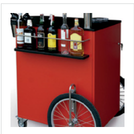
Manufacture in various colors