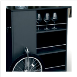
With 3 shelves for drinks