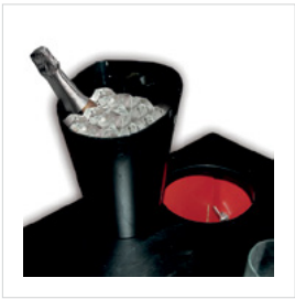
With two ice buckets

Dimensions (widthxheightxbottom) 1100x1050x620mm