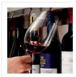
Supplied directly from the bottle