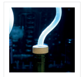
Supplied directly from the bottle