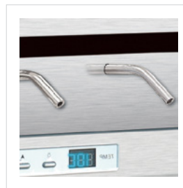
Dosage for full glass or bottle